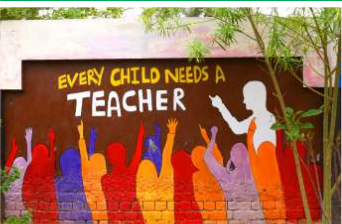
Gratitude to a teacher