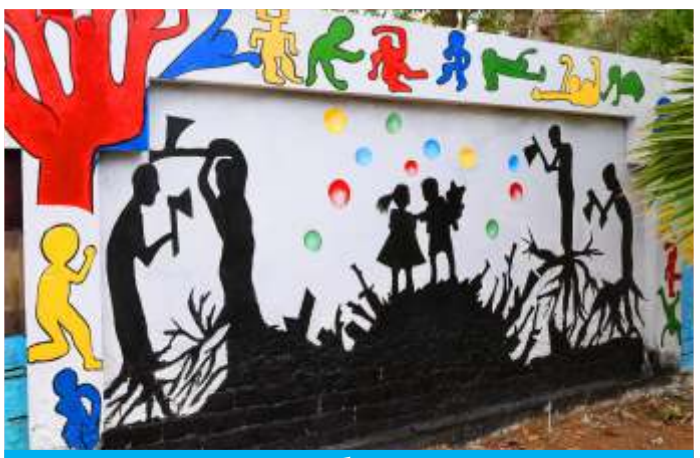
Preserving the Ecosystem